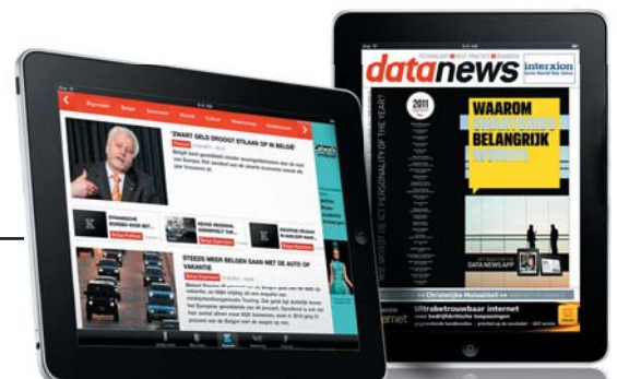
iPad, vertical banner & horizontal banner