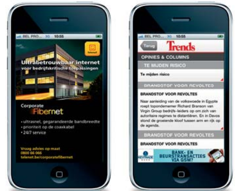
iPhone, splash & floor ad