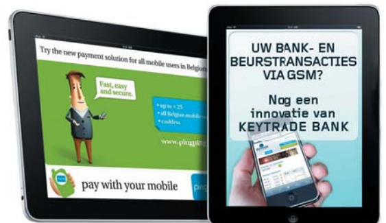
iPad, horizontal splash & vertical splash